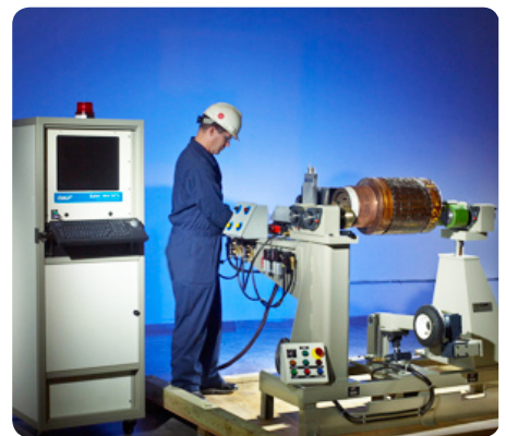
The Baker WinTATS automated traction armature test system for quality control and assurance

The standard test sequence involves a specified set of AC and/or DC hipot, resistance and surge tests for each armature. All tests